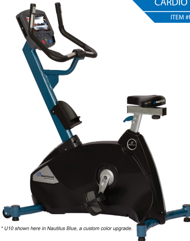
* U10 shown here in Nautilus Blue, a custom color upgrade.