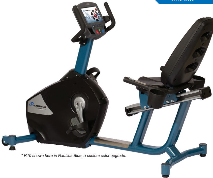
* R10 shown here in Nautilus Blue, a custom color upgrade.