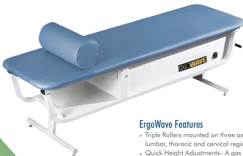
ErgoWave shown with optional knee bolster