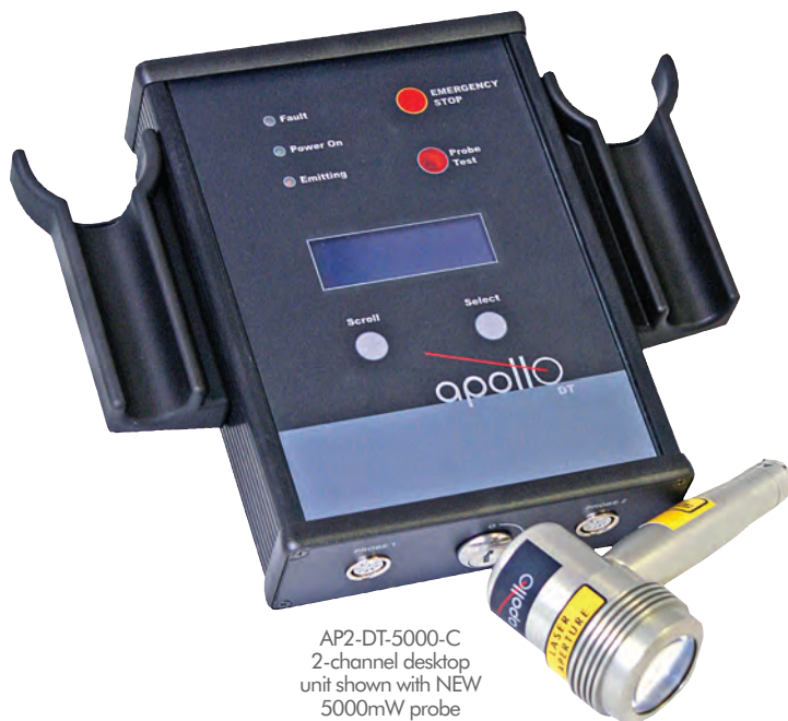
AP2-DT-5000-C 2-channel desktop unit shown with NEV 5000mW probe