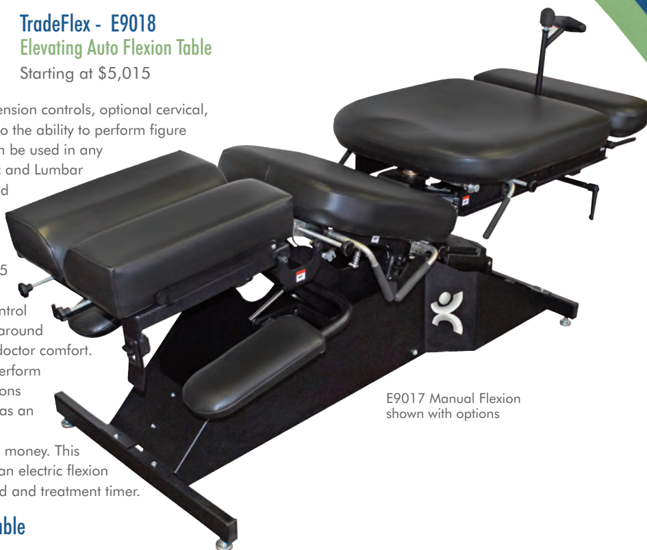
E9017 Manual Flexion shown with options

The TradeFlex Series features electric tension controls, optional cervical, thoracic, lumbar, and pelvic drops. Also the ability to perform figure 8 range of motion. The pelvic drop can be used in any position. Introducing optional Thoracic and Lumbar drops in a single chest cushion. P-A and lateral flexion can be locked in any position. The table also features a smooth range of +/- 15 degrees of lateral flexion and a flexion depth of 15 degrees to accommodate almost any angle of drive. A removable flexion control t-bar allows the doctor to move freely around the table which improves patient and doctor comfort. The TradeFlex table allows the Dr. to perform optimum correction of spinal subluxations or disc problems, yet can still function as an exam, adjusting, or therapy table. This versatility will save the doctor time and money. This workhorse table is also available with an electric flexion option that offers variable flexion speed and treatment timer.