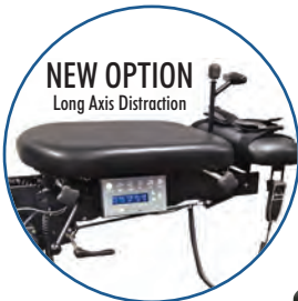
NEW OPTION Long Axis Distraction

ErgoStyle TM FX Counterbalanced Flexion addresses the core needs of chiropractors. The ErgoStyle TM FX table is a sophisticated table that offers full, ultra smooth, counterbalanced flexion at its lowest height (20") and quietly elevates to its full height of (31"). The new design offers infinitely variable electric spring tension distributed in such a way to allow for fingertip effort in moving the caudal section in any direction.