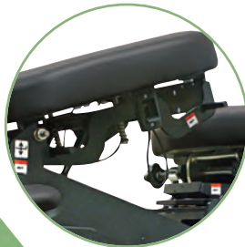
ES58359 - Breakaway, Elevating Chest Option