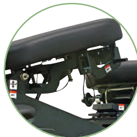
ES95005 - Breakaway, Elevating Chest Option