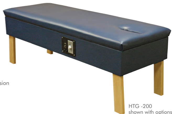
HTG -200 shown with options