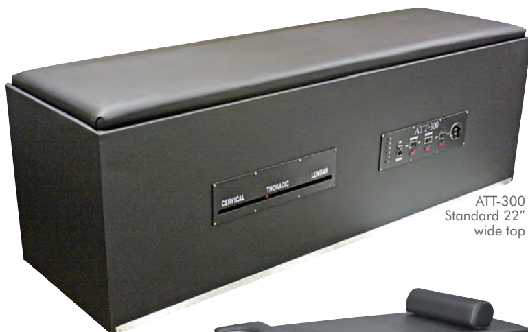
ATT-300 Standard 22" wide top