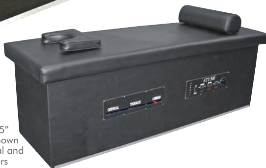
ATT-300 Optional 25" wide top shown with cervical and knee bolsters