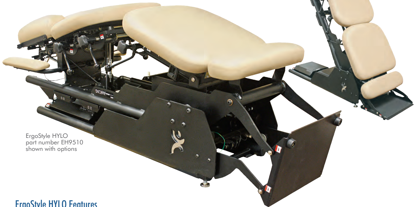
ErgoStyle HYLO part number EH9510 shown with options

ErgoStyle TM HYLO is a revolutionary adjusting table with many standard features previously considered upgrades. Improved ergonomics include: bilateral control placement, powered front and pelvic sections, free falling Accelerator TM III Drops, gas spring assist on headpieces, chest and pelvic cushions.