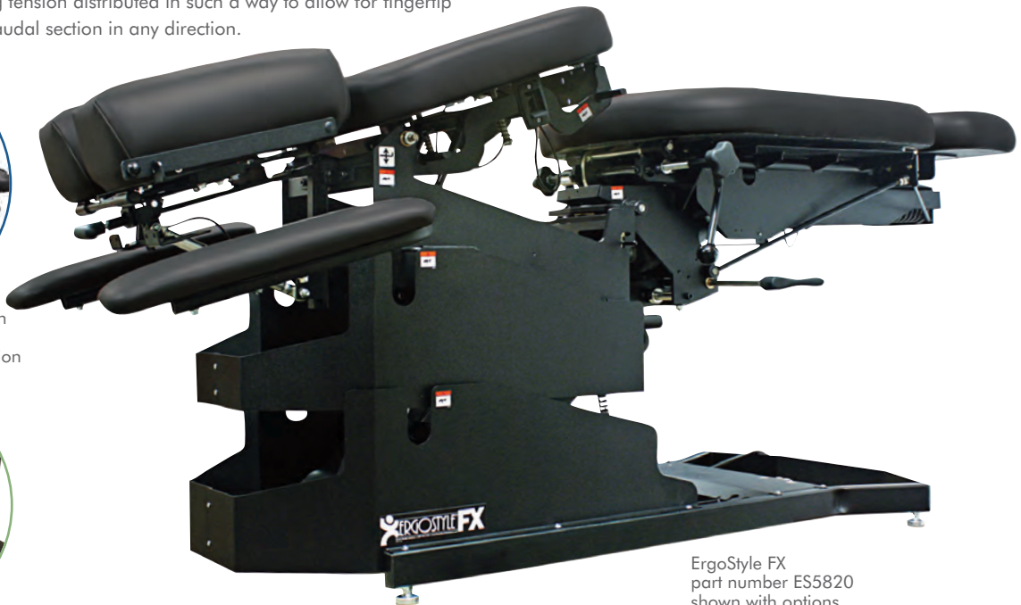
ErgoStyle FX part number ES5820 shown with options