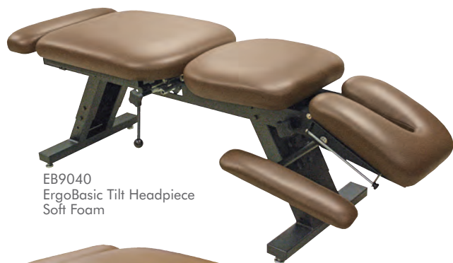
EB9040 ErgoBasic Tilt Headpiece Soft Foam