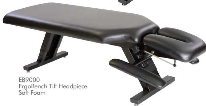
EB9000 ErgoBench Tilt Headpiece Soft Foam