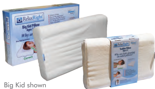
Big Kid shown

The "soft feel" traditional-shape memory foam pillow is made of temperature-sensitive memory foam that molds to your body to provide luxurious comfort and support. The cool circulating core helps to eliminate overheating. The antimicrobial cover is made of plush cotton velour and is resistant to allergens, dust mites, mold and mildew. 24" x 16" x 5"