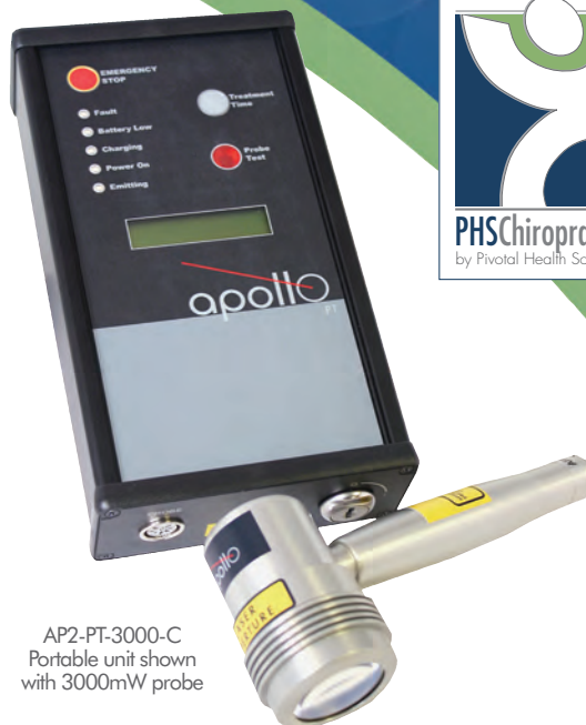
AP2-PT-3000-C Portable unit shown with 3000mW probe