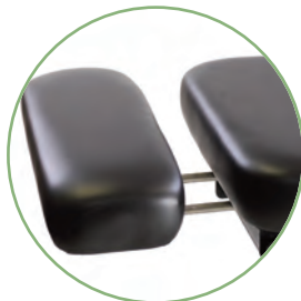
Standard 6" Extending Ankle Rest