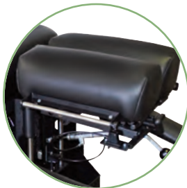
ES95004 Headpiece Option

ES58494 - Manual Flexion ES59496 - Auto Flexion Long Axis Distraction Option