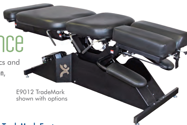
E9012 TradeMark shown with options

The Trademark Stationary is an affordable alternative for a growing practice. With its impressive list of standard features, this table is an excellent choice for a starter table. The Trademark table is a low priced table that offers the same high quality construction as other Pivotal Health Solutions tables.