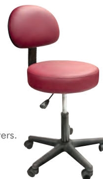
19310 Rolling Stool with Back