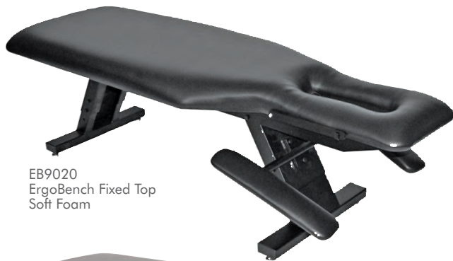
EB9020 ErgoBench Fixed Top Soft Foam

Quality, Ergonomics, Performance. It's all in the family