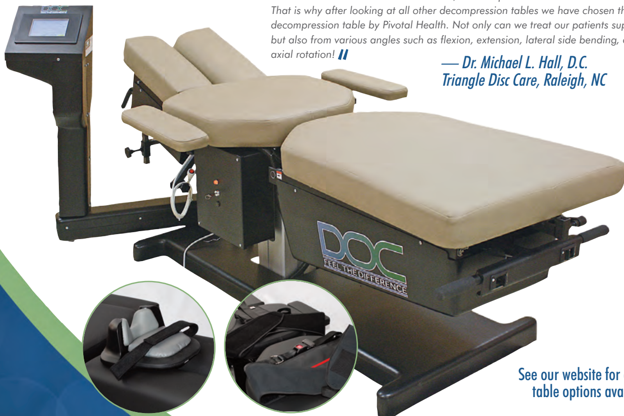
Cervical Capture Headpiece