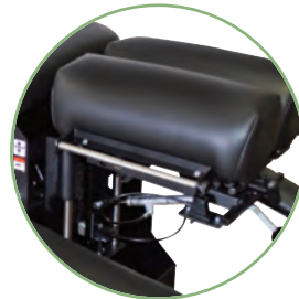
ES95004 Headpiece Option