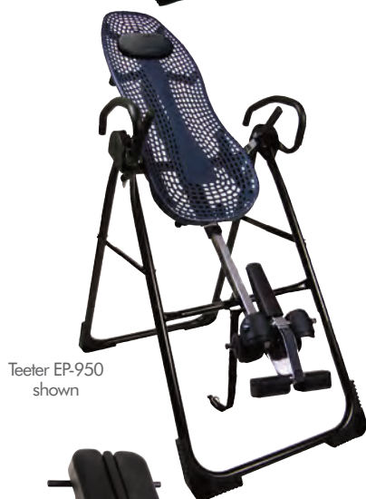
Teeter EP-950 shown