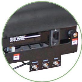
Patented Accelerator III Manual & Auto-Cocking Drops