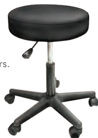
19332 Rolling Stool