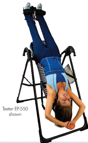
Teeter EP-550 shown