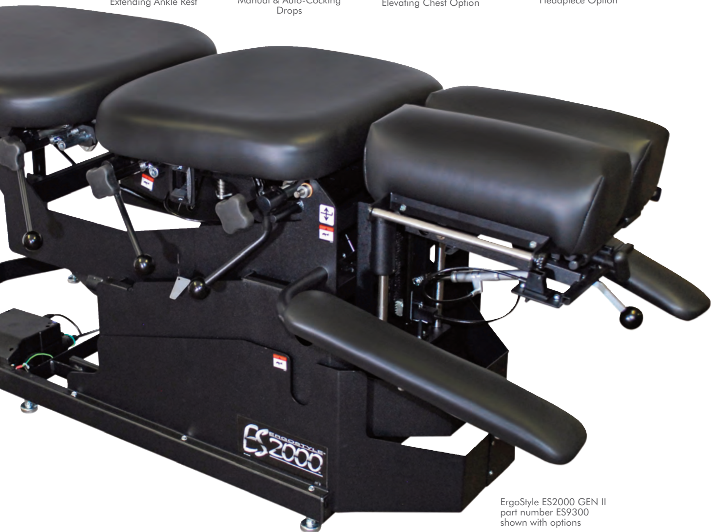
ErgoStyle ES2000 GEN II part number ES9300 shown with options