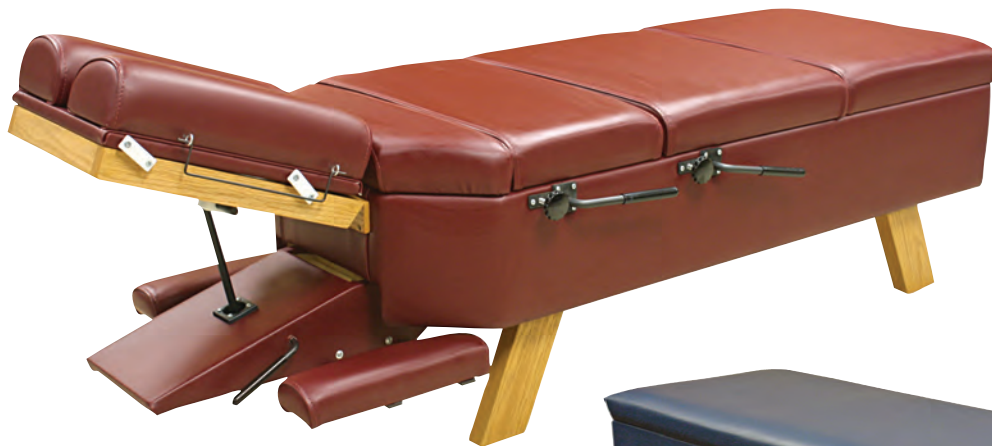
HTG -100 shown with options

Your new HTG Series has been designed and engineered to comply with the rigid standards of practitioners. The HTG 100 bench and HTG 200 Roller Massage Bench come with many standard features. Your new bench is designed to provide you with years of service. With proper maintenance your bench should remain virtually trouble free.